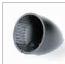
Tilted mounting Easy installation